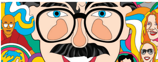
SUPERMENSCH THE LEGEND OF SHEP GORDON

A&E IndieFilms® is proud to support the GETTING REAL Documentary Film Conference 2014.